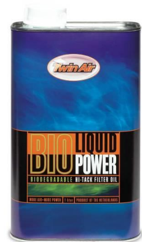
[ Filter oil part number 159017 ]